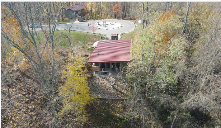
Pictured left: Red Maple Treetop Villa

Please continue to stay connected with us with this newsletter, our website www.grandvuepark.com and by following us on Facebook, Twitter and Instagram! Remember, Wild and Wonderful starts here!