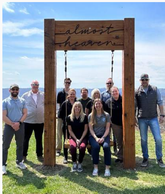
Pictured with the swing are Grand Vue Park Managers

The Grand Vue Park selfie swing is located next to the scenic overlook that oversees the city of Moundsville. If you're planning to be in the area, be sure to check out other swing locations including Wheeling Heritage Port!