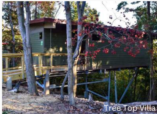
Tree Top Villa

For Grand Vue Park RV guests! 50% off RV reservations now through May 25 with code: GVPRV50