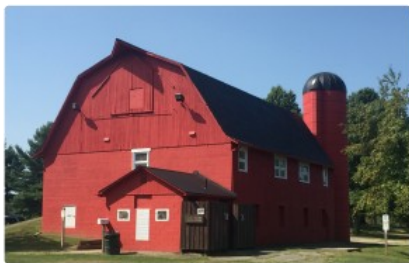
Above: The iconic Red Barn at Grand Vue Park.

Here at the park we are very excited about the drastic changes that are being done to the Red Barn. Massive renovations are being done now and will continue for the next couple months. The Red Barn will be home to the West Virginia Disc Golf Hall of Fame, which a