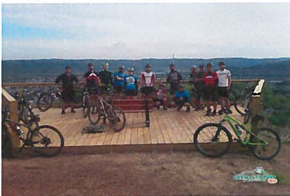
Above: Local mountain bikers on a Wednesday group ride taking in the view at the Scenic Overlook at Shelter 5.

Some big news on the mountain bike front this year for Grand Vue Park. On July 3rd there will be a WVMBBA ( West Virginia Mountain