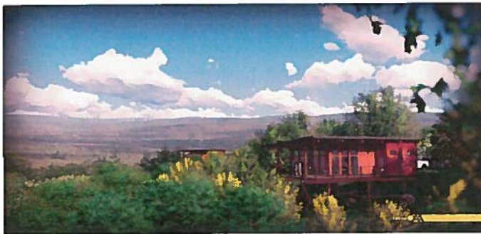
Above: Tree House cabins find home in the canopy at Grand Vue Park.

Grand Vue Park has broken ground on four tree house style cabins. We will have