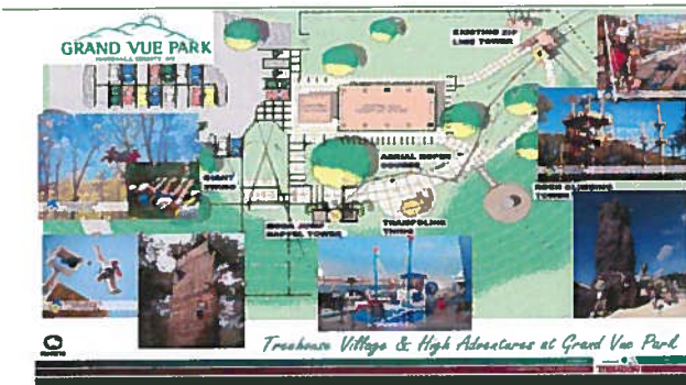
Above: The new High Adventure Course at Grand Vue Park.

Big things are happening in the High Adventure area of the park. Grand Vue Park has already broke ground on the new high ropes course that will tie into the existing